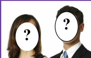
ECU Interns, Summer 2009

*Students who have graduated or will graduate before the internship begins are not eligible.