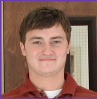
WCU Intern, Spring 2008